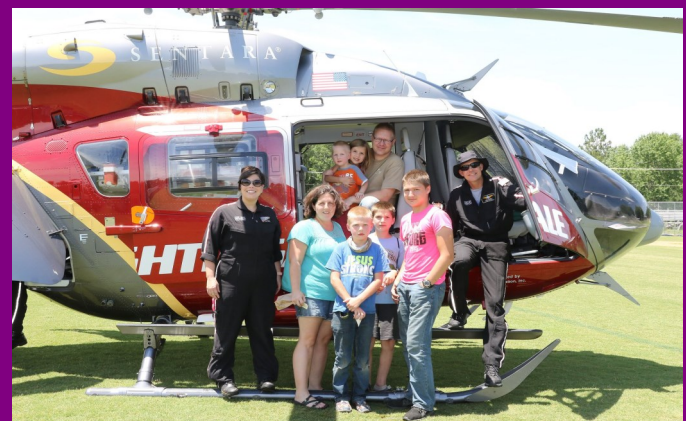
Nightingale will be arriving/landing on Armory Field at 1:30PM for children to tour...