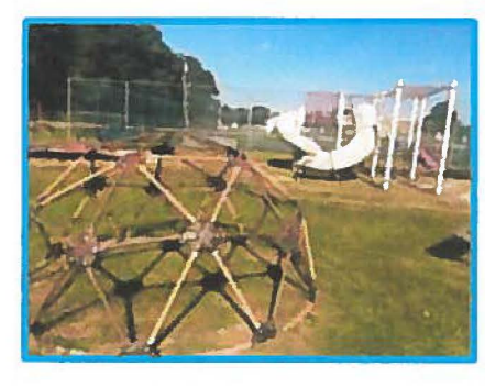
Current Playground – we can't wait to see the AFTER pictures!

The IP Way Forward is how we go beyond just doing the right things, the right ways, for the right reasons — all the time. It's how we create value for International Paper, and all of our stakeholders, for generations to come. The playground project embodies that vision and we can't wait to get started!